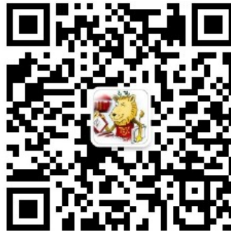
Figure 1 关注我们公众号，学习更多知识